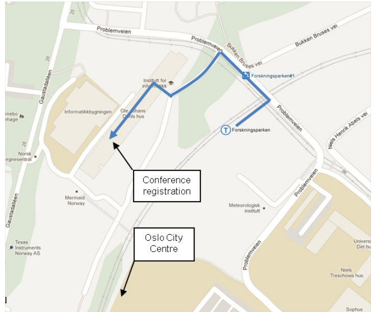
Getting from Forskningsparken metro station to the conference venue